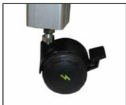
Lockable Wheels Part No. 78201-010088