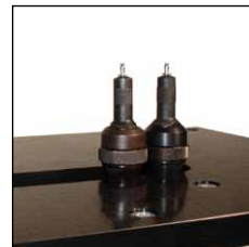
Standard nose equipment

** for fasteners < ø 2.4 mm the air cursor option is recommended