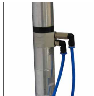
Air cursor Part No. 78201-010087