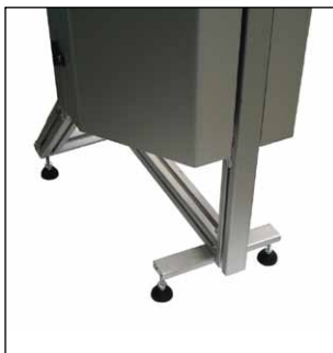
Stand version Part No. 78201-010089