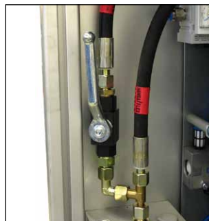
Single module switch-off Part No. 78201-010090