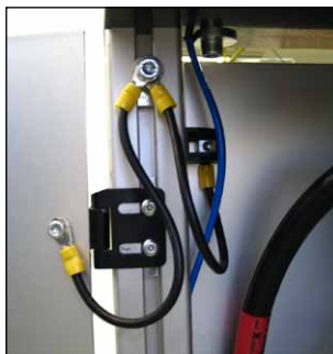
ESD version Part No. 78201-010091