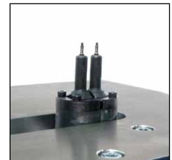
Riveting pitch reduced to 17 mm can be realised with the CP (close pitch) version.